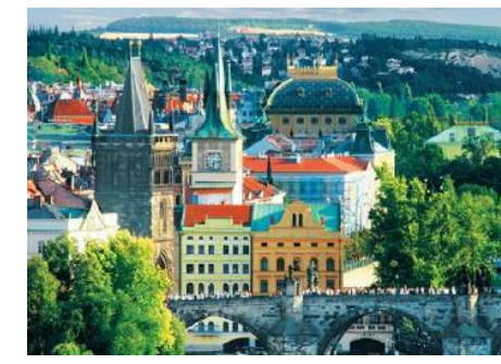
PRAGUE, CZECH REPUBLIC

In Oslo, view the world's best preserved Viking ship at the Viking Ship Museum and see the Royal Palace. Board a train to Bergen for a stunning journey over the Hardangervidda, Europe's highest mountain plateau. Includes all hotels, breakfasts and transfers.