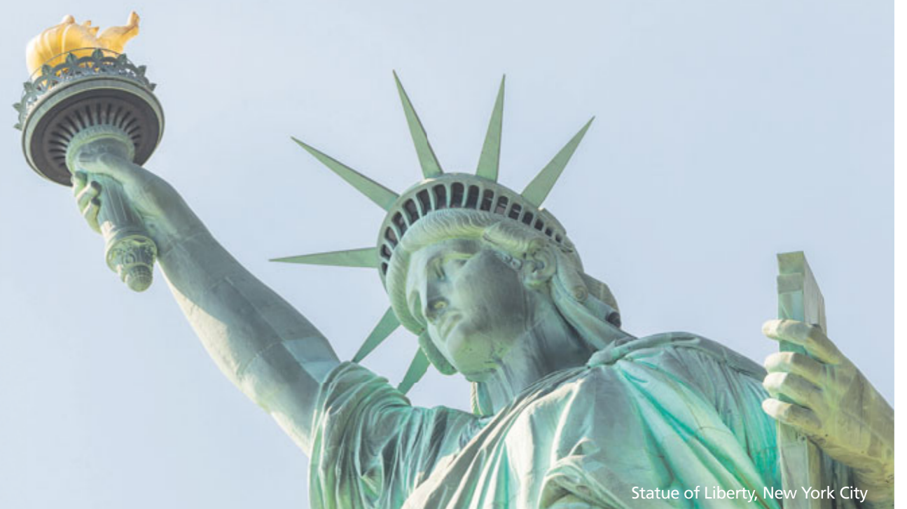
Statue of Liberty, New York City