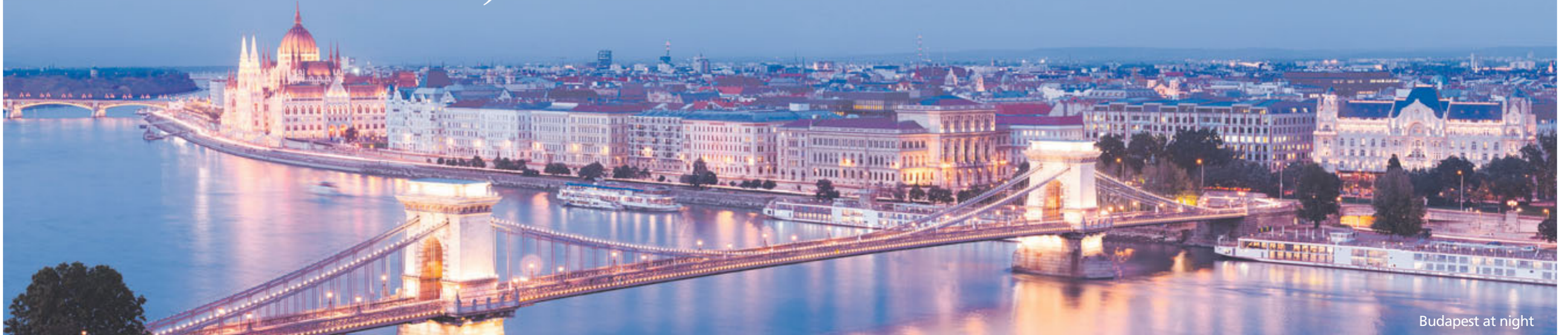
Budapest at night