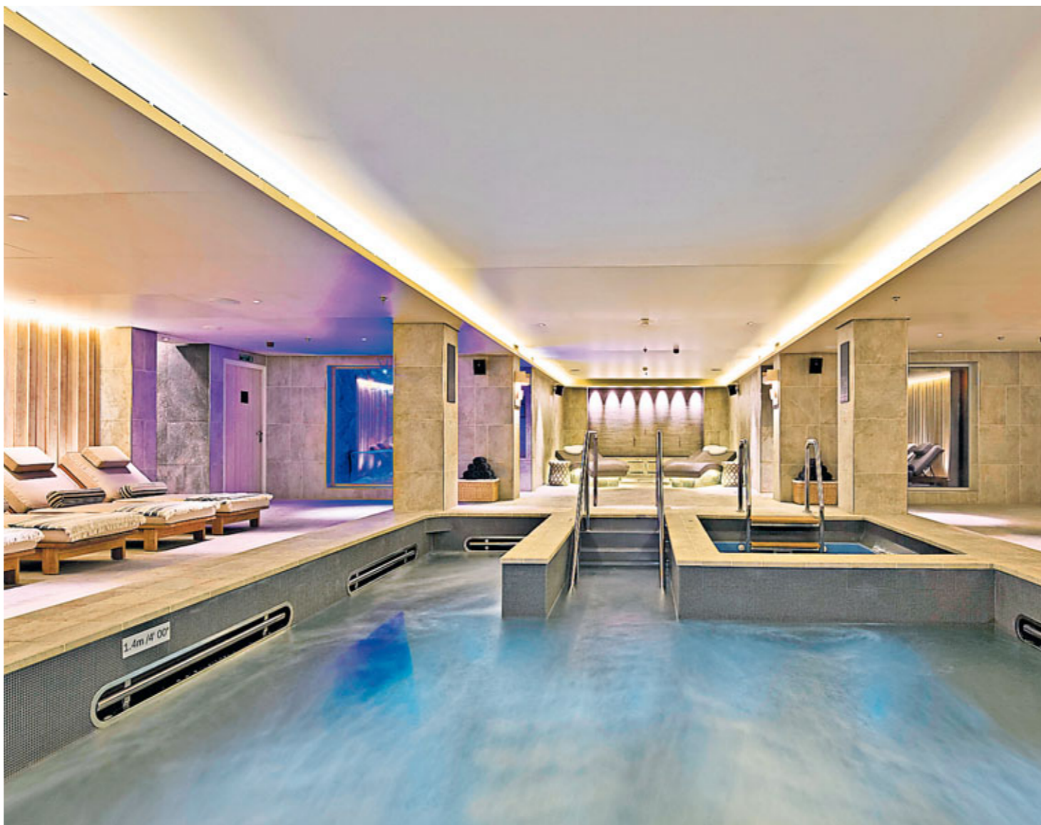
A cool experience Visiting The Spa with its unique snow grotto, below, creates a great sense of well-being