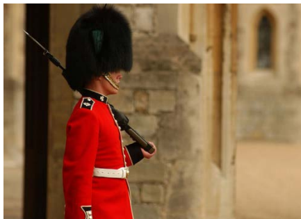
LONDON, UNITED KINGDOM

In Oslo, view the world's best preserved Viking ship at the Viking Ship Museum and see the Royal Palace. Board a train to Bergen for a stunning journey over the Hardangervidda, Europe's highest mountain plateau. Includes all hotels, breakfasts and transfers.