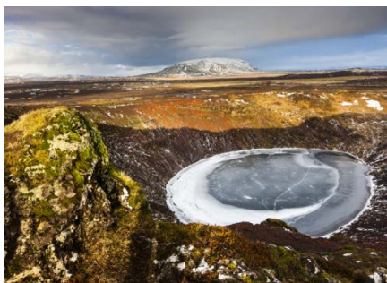
KERID CRATER, ICELAND

EXTEND YOUR JOURNEY BEFORE OR AFTER YOUR CRUISE. Make the very most of your time away from home by extending your journey with one of our city stays or tours. Spend a little more time in these great destinations. Our expert local guides and hosts will help you get the very best from your stay.