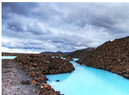
BLUE LAGOON, ICELAND