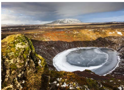
KERID CRATER, ICELAND