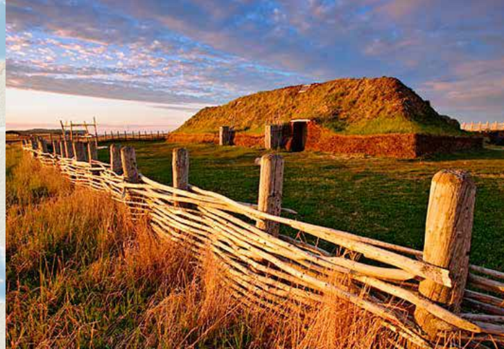
L'ANSE AUX MEADOWS, NEWFOUNDLAND, CANADA