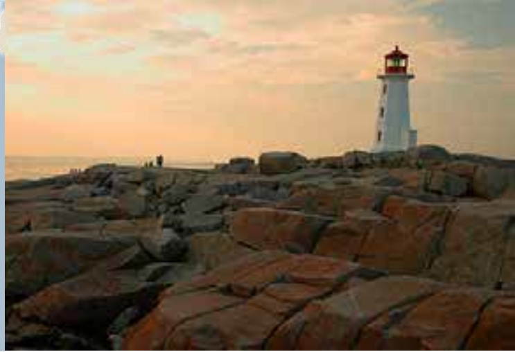
PEGGY'S COVE, HALIFAX, NOVA SCOTIA