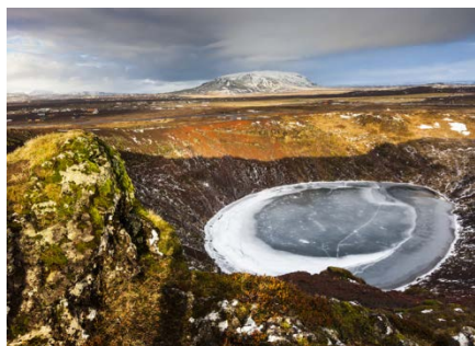
KERID CRATER, ICELAND

EXTEND YOUR JOURNEY BEFORE OR AFTER YOUR CRUISE. Make the very most of your time away from home by extending your journey with one of our city stays or tours. Spend a little more time in these great destinations. Our expert local guides and hosts will help you get the very best from your stay.